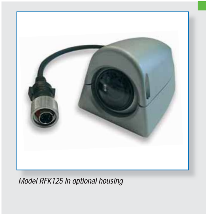
Model RFK125 in optional housing